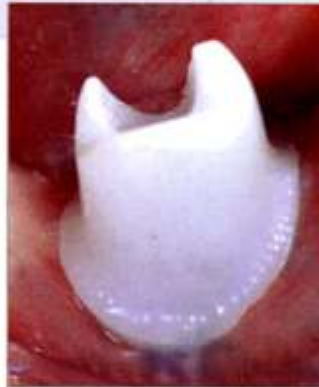
Ready to seat abutment aligns precisely to healed tissue

All ceramic design eliminates metal interfaces for an exceptional esthetic result.